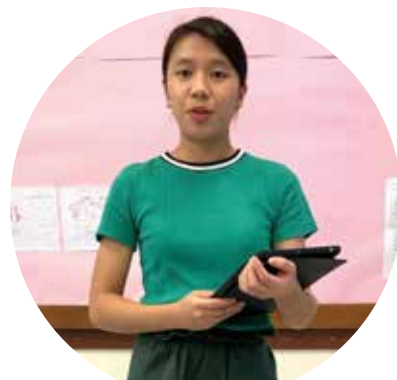
News Feature Presentation