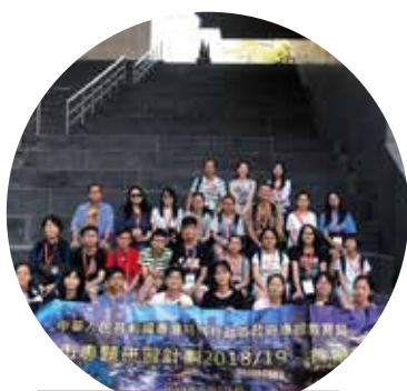
STEM學習領域主辦的 「智慧城市專題研習計劃 首爾學習團」