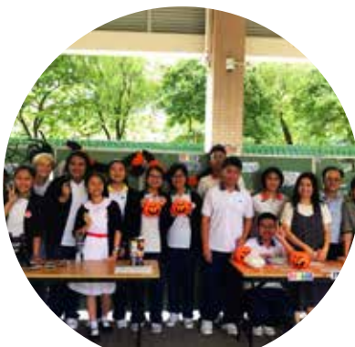
English Games Day