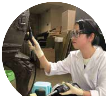
東華三院學生文物 保護大使計劃