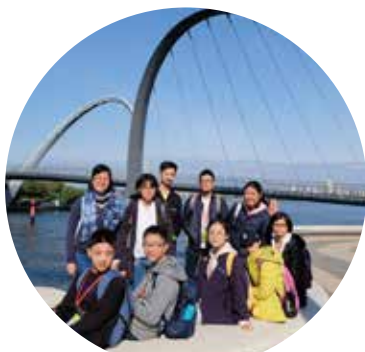
澳洲珀斯 英語學習團