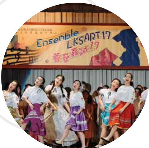
2017 - School Hall

為促進學校的藝術氛圍以及讓學生發揮所學，自1999年起，我們每年都會在學校禮堂或校外表演場所（包括沙田大會堂、香港文化中心、大專會堂和元朗劇院等）舉辦「薈藝嘉誠」綜藝節目，讓我們的學生在音樂、舞蹈和戲劇方面一展所長。由2018年起，「薈藝嘉誠」與「樂聚嘉誠」改為兩年一度演出。