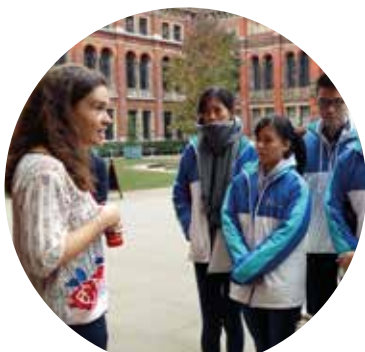
東華三院學生大使 倫敦參訪團