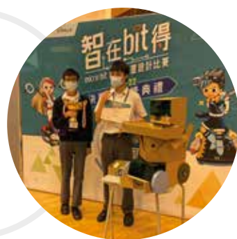
「智在BIT得」MICRO:BIT 創意裝置設計比賽 冠軍

We provide opportunities for students to develop creativity, problem-solving, and critical thinking skills in authentic contexts, and prepare them to continue their studies in designs and technology at a higher level or future development in other aspects.