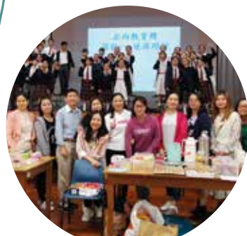
於「正向教育週」 負責小食攤位