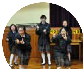
Forum Theatre - Hong Kong Theatre Works

本校藉著外界專業藝術團體及藝術家的協助，透過多元化的學習活動，提高學生對藝術的興趣。例如「駐校藝術家」計劃、「學校藝術教育培訓計劃」、「憧憬世界」攝影教育計劃、「看得見的記憶」藝術教育計劃等。