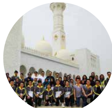
東華三院中學聯校 「一帶一路」杜拜參訪團