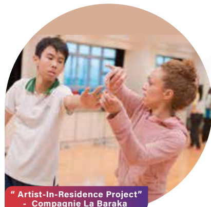
"Artist-In-Residence Project" - Compagnie La Baraka

我們由1999年開始，已將「一人一樂器」計劃，擴展為「一生一藝術」計劃，由原來所有初中學生必須學習一種樂器，擴展至可以選擇音樂、舞蹈、戲劇、美術、攝影、書法、繪畫等不同的範疇。