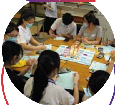
「認識自己性格強項」 工作坊