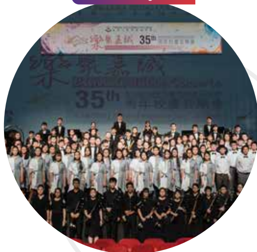
2018 - Yuen Long Theatre