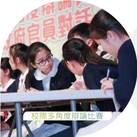
校際多角度辯論比賽