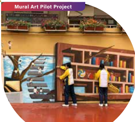
Mural Art Pilot Project