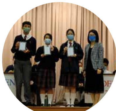
Inter-house Debate Competition

To assist pre-S1 students in adapting to English Medium Instruction (EMI), a summer bridging course featuring classroom language and subject vocabulary is run every year.